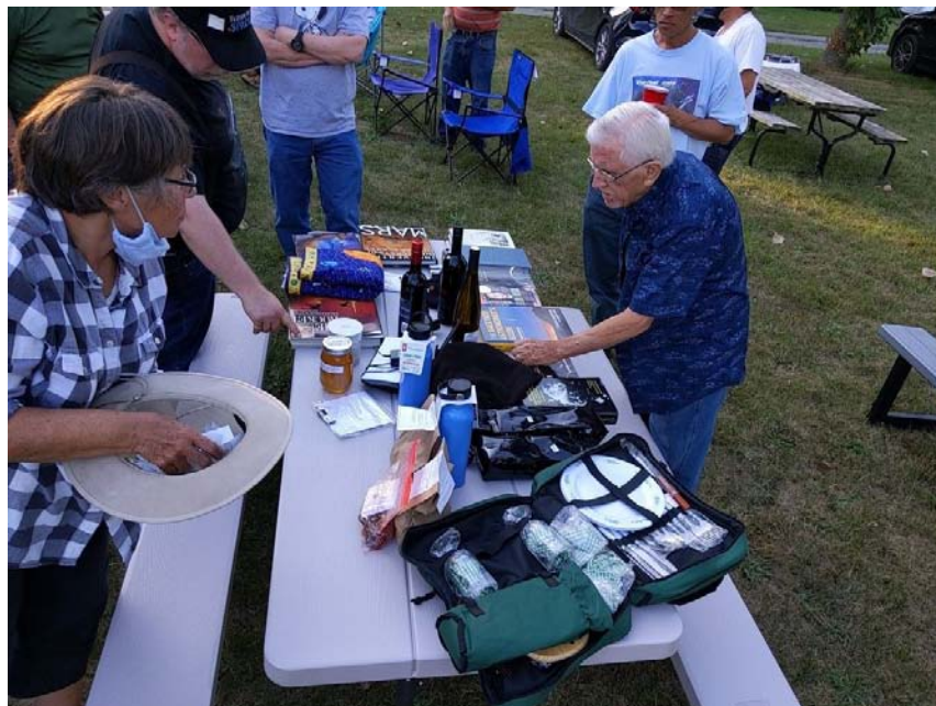
Door Prize Table at Fall'N'Stars 2021

The RASC Kingston Centre was established in 1961 and currently has approximately 70 (2022Sept) members. We meet monthly for two hours at Queen's University in Kingston Ontario. There are presentations from excellent speakers and members are encouraged to share their latest interest. These meetings are free to the public and guests are always welcome. Since COVID19 struck in early 2020, we have held monthly virtual Zoom videoconferencing socials for members and their guests.