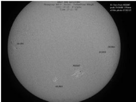
The remnants of AR2887 CME and X1 flare