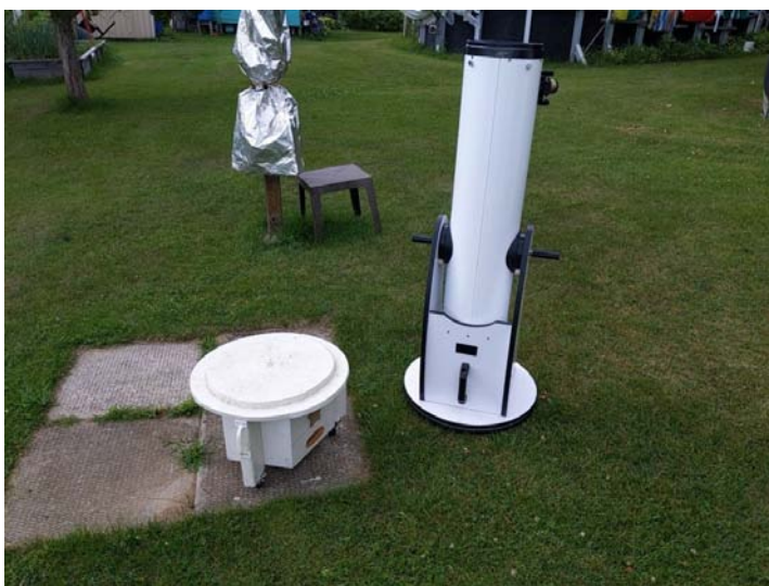
A 20cm Dobsonian with patio stones and a stand for low elevation targets – kevin kell

This Centre is yours and we need your input and help to bring you the Centre you want.