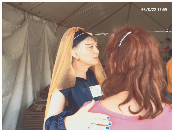
Vulcans welcome Starfest Star-Party Goers

Weather for 2003 was mostly great and clear! Some images will be sprinkled throughout this issue.