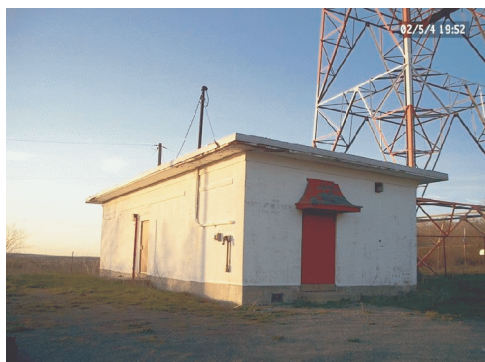
The Tower Hill Building - outside

The Executive and other interested parties took a tour a few weeks back and although there are some issues with access, it doesn't look too bad.