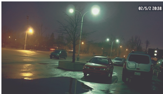
Queen's University Parking Lot near the Observatory