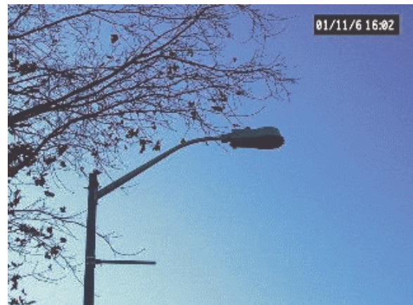
Full Cutoff fixture now being introduced into Kingston