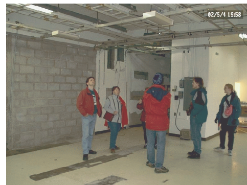
The Tower Hill Building - inside