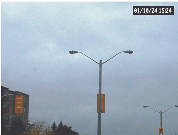
Standard Cobra Head Fixtures - bad!

RASC Kingston Centre is moving towards a more active Light Pollution Abatement Group. As part of the activities of the group, an LPA display has been created, along with an LPA brochure (available on our web site on the LPA page) and an online collection of local Kingston Area LPA images.