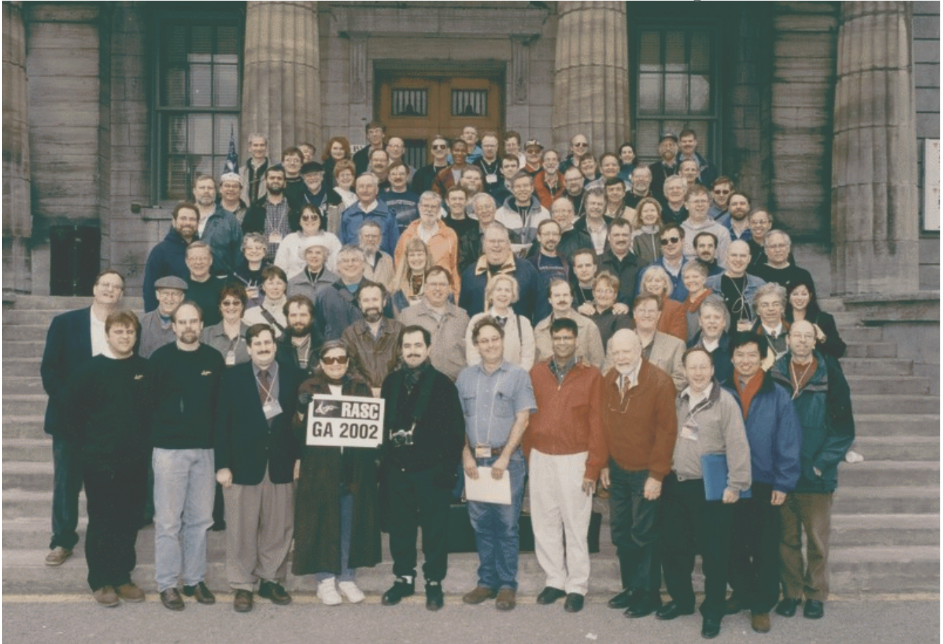
The 2002 General Assembly in Montreal - Group Photo

Let's talk about the General Assembly. This year it was to be held in Montreal. I haven't been to Montreal in decades, so it sounded like a good idea. After all, for one that does not travel, General Assemblies are more of an opportunity to travel and see new places as much as they are a chance to meet fellow RASCALS and to find out more of what is happening within the Society. So off to Montreal we went, on Thursday night May 16 th with a few other RASC-KC'ers and arrive at the *HUGE* train station a few hours later. We were met by local Montreal Centre members (a nice GA touch that) who escorted us on a 15 minute walk to the accommodations. It was a reasonably warm night, albeit cloudy and overcast, a foreshadowing of weather to come. The first night saw renewing of acquaintances with folks from Regina and Winnipeg, amongst others. We trotted up the MOUNTAIN to the Montreal Centre's Observatory (no longer operational) where the first of many things happened.