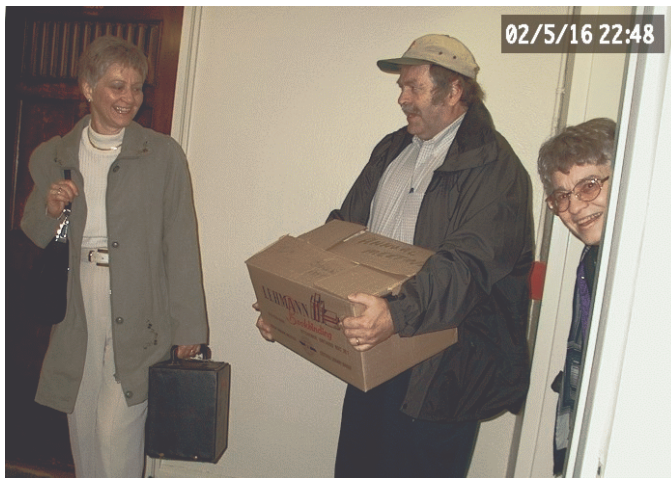
As always, there is work to be done at a GA and paper to be carried!

It was so busy again that we never had a chance to take in the Planetarium. It may take a day trip in from Kingston to attend!