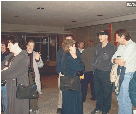
Some serious Astro-related discussions during the May meeting break (right) and some attempts to count beyond the number four (left).