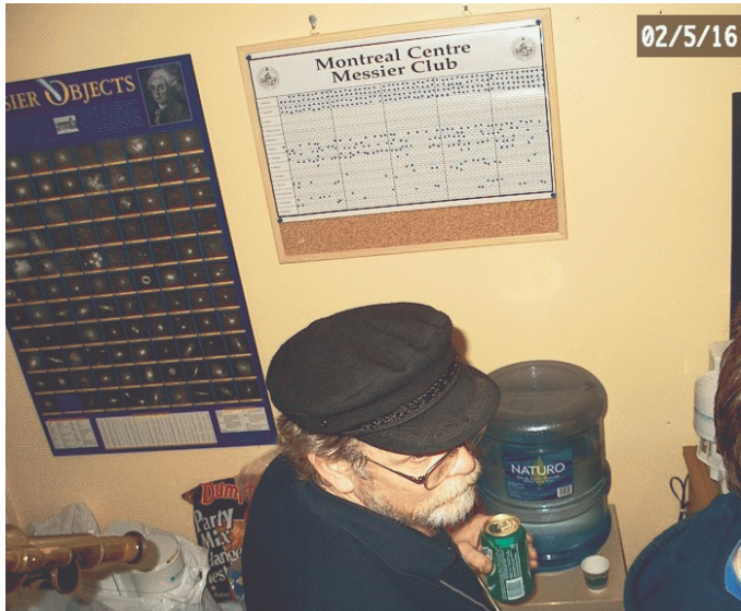
The Messier Club Chart of the Montreal Centre

A small chart with the progress of members on their Messier Certificate quest. What a great idea! Something to boost the hunt for Messier objects and help get people out and observing!