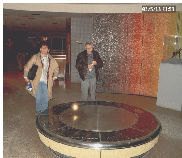
Some members from the Belleville Area trying to tell the time in Stirling Hall