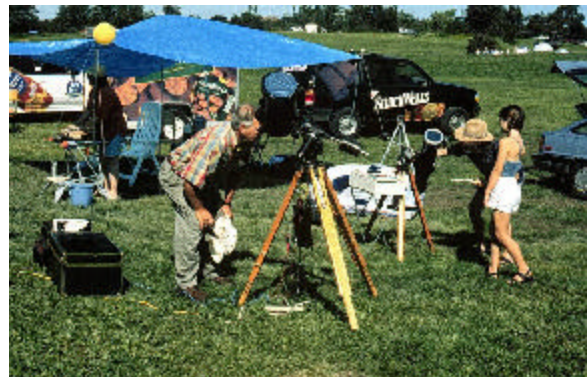
The Sky is the Limit Festival '98 (this year Saturday July 3 rd , 1999 at Lemoine Point)

W here: Regular Meetings of the Kingston Centre are held on the 2nd Friday of each month (unless noted otherwise) at 20:00 local time in Room B-201, Mackintosh-Corry Hall at Queen's University (parking available off Union Street at Frontenac).